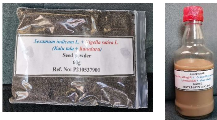
Figure 1. (a) Seeds of Sesamum indicum L. and Nigella sativa L. (b) Decoction made out of both seeds

Preparation of research drug: Seeds of S. indicum and N. sativa were purchased from an Ayurvedic drug supplier in Colombo district, Sri Lanka. The plant materials were identified, washed, dried, and decoction prepared (Figure 1) according to Ayurveda Pharmacopeia (Anonymous, 1994).