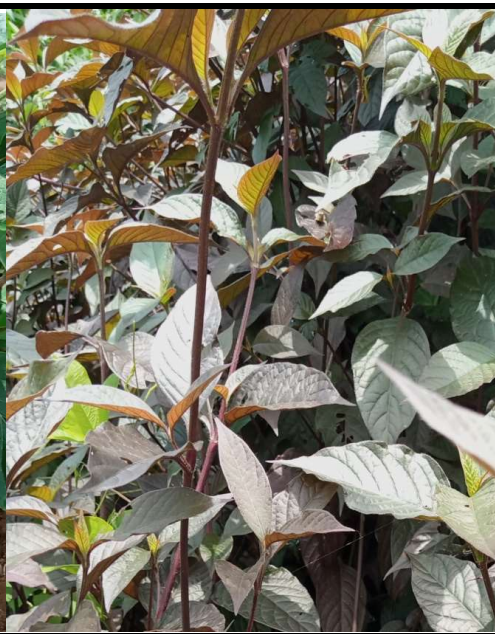
Plate 4: Alternanthera brasiliana