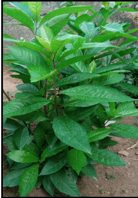
Plate 1 Petiveria alliacea

described by Lorke (1983) with slight modifications. The first stage involved the usage of forty-eight (48) broiler chickens (male and female) of three weeks old (3 weeks) weighing 608.20 – 730.30 g.