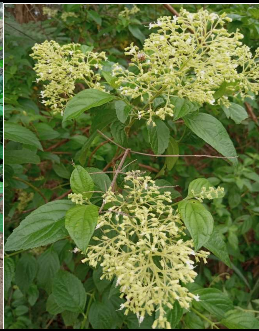
Plate 2 Hoslundia opposita